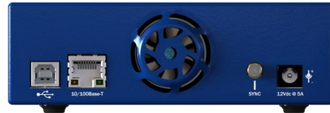
USB & 10/100Base-T Management Ports Fan Sync 12Vdc Port @ 5A